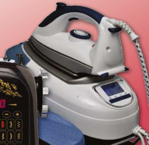
New Singer Steam Station Iron