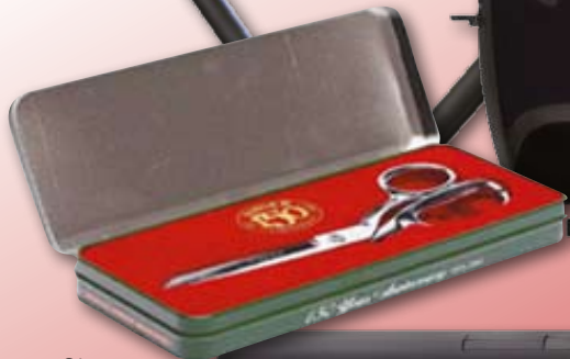
Singer Heritage Scissor Kit