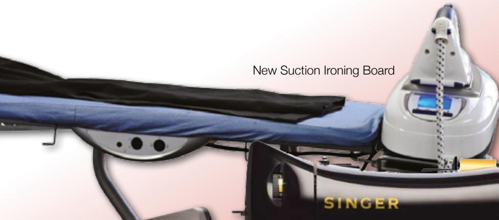
New Suction Ironing Board